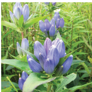
Gentiana andrewsii , bottle gentian

Phlox divaricata , woodland phlox Polystichum acrostichoides , Christmas fern Tiarella cordifolia , and T. 'Brandywine', foamflower Spigelia marilandica , Indian pink Gentiana andrewsii , bottle gentian Solidago caesia , bluestem goldenrod