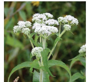
Eupatorium perfoliatum , white boneset