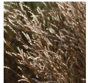
Schizachyrium scoparium , Little Bluestem