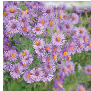
Symphyotrichum novae-angliae , New England aster

Symphyotrichum novae-angliae , New England aster Symphyotrichum lanceolatum , panicled aster Eupatorium maculatum , Joe Pye Weed Eupatorium perfoliatum , White boneset Veronicastrum virginicum , Culver’s root Lobelia syphilitica , great blue lobelia Asclepias incarnata , swamp milkweed Osmunda cinnamomea , Cinnamon fern