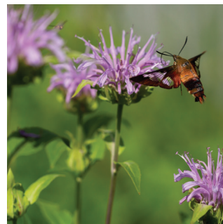
Monarda fistulosa , Wild Bergamot

Monarda fistulosa , Wild Bergamot Penstemon digitalis , Foxglove beardtongue Campanula rotundifolia , Harebell Asclepias tuberosa , Butterfly Weed Symphyotrichum laeve , Smooth Blue Aster Schizachyrium scoparium , Little Bluestem