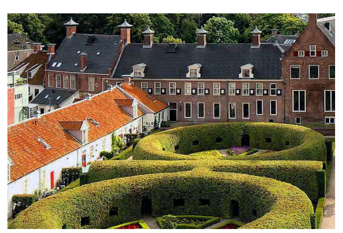
Please joins us for a week of wonderful explorations of historic and contemporary gardens and structures in the Netherlands!