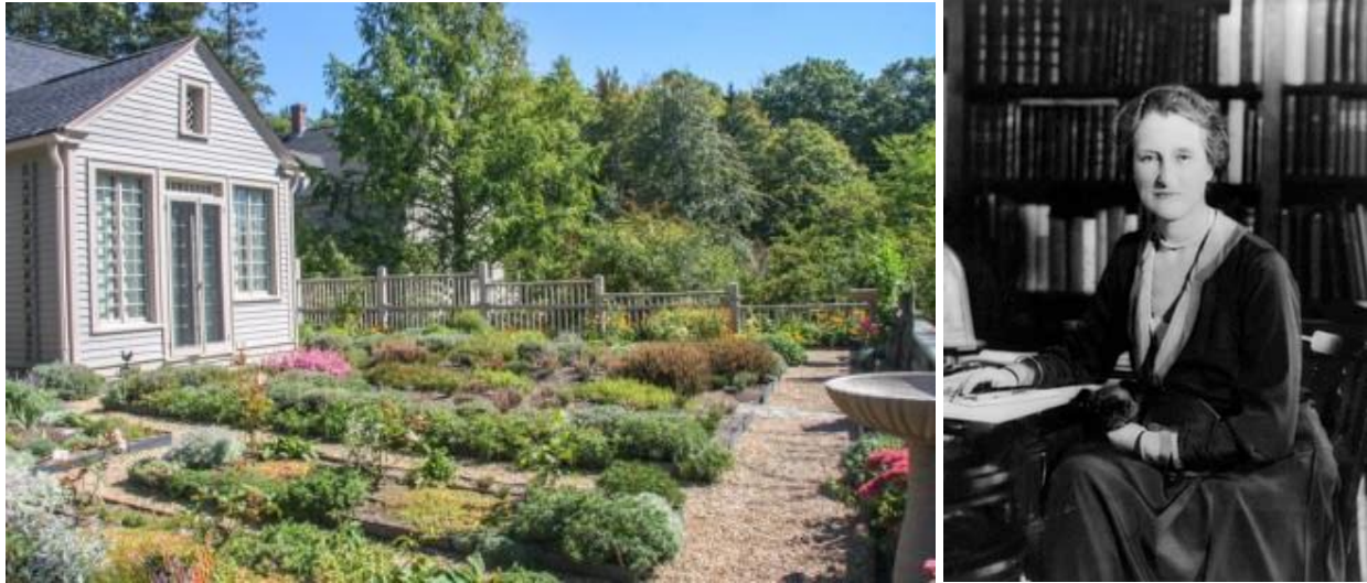
Garland Farm, Salisbury Cove. Beatrix Farrand.

The Berkshire Botanical Garden invites you to join an exclusive tour to discover these gardens and more, including a collection of other private gardens scattered throughout the island, one still maintained as designed by Farrand where we will have lunch and an Italianate garden.