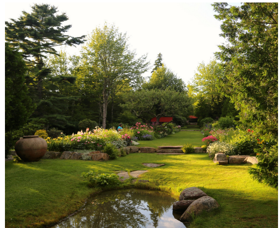
Left: Abby Aldrich Rockefeller Garden, Seal Harbor. Right: Thuya Garden, Northeast Harbor.

Collections of plants from Farrand’s Reef Point home that no longer exists can now be seen at the Asticou Azalea Garden , a Japanese-style flowering garden, and at the Thuya Garden , both at Northeast Harbor. The latter offers a variety of annuals and perennials that line two long sides of the garden. A pavilion sits at the top of a slight incline overlooking the main garden that cascades down to a reflecting pool. Another Farrand garden can be found at her last home, Garland Farm , Salisbury Cove, now maintained by the Beatrix Farrand Society and where a lecture will be given on her life and work.