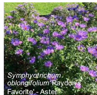
Symphotrichum oblongifolium 'Raydon's Favorite' - Aster