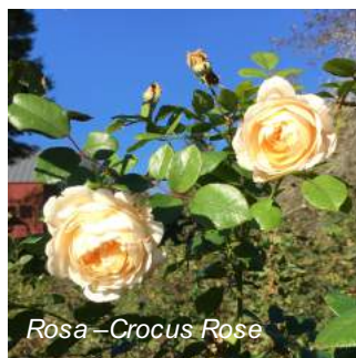
Rosa - Crocus Rose

Symphotrichum oblongifolium 'Raydon's Favorite' - Aster