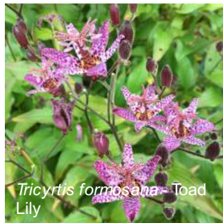
Tricyrtis formosana - Toad Lily