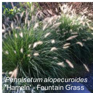
Pennisetum alopecuroides 'Hameln' - Fountain Grass