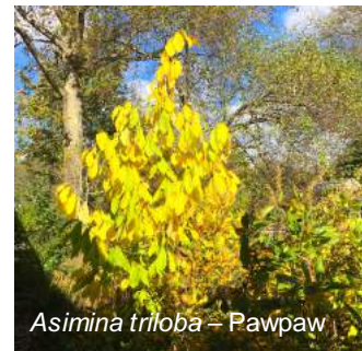
Asimina triloba - Pawpaw